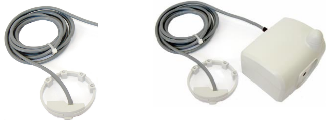
With ARROW remote reading system